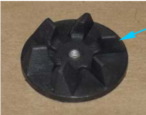
CLUTCH, RUBBER 990034700